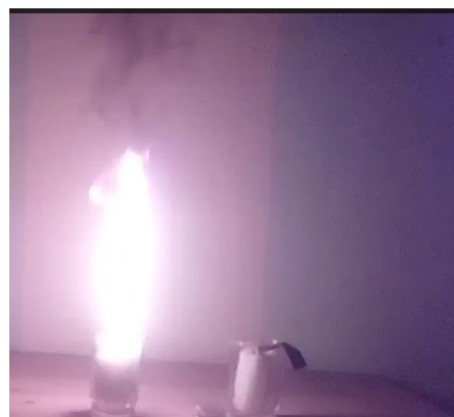
Figure 4. Lighting when using kerosene.