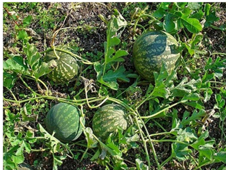
Figure 1. Citrullus Colocynthis fruit [6].

and aerial parts of Citrullus colocynthis , fruit contains isovitexine, iso-orientien and iso-orientien 3, methyl ether, while the aerials parts contains three c-p-hydroxy benzyl derivatives as, 8 c- p - hydroxy benzyl livsotexin 6-c-p-hydroxylivtixin and 8 c- p-hydroxy benzyl livsotexin 4- o-golocosides [5].