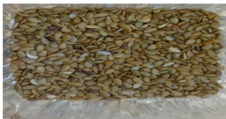
Figure 2. Citrullus Colocynthis seeds (Researchers).

Citrullus colocynthis known as bitter cucumber, is a fruit-bearing plant, seed oil is used for frying and cooking in some African and Middle Eastern American countries owing to its unique flavor [1]. The desert Bedouin are said to make a type of bread from the ground seeds. There is some confusion between this species and the closely related watermelon, whose seeds may be used in much the same way. The seed flour is rich in micronutrients (vitamins and minerals), calcium and niacin and could therefore be used in food formulations especially in regions with low milk consumption like West Africa [7].